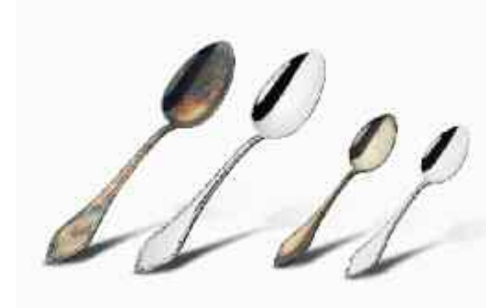
Silver cutlery before and after cleaning/polishing

In contrast to common cleaning technology, Trowal cutlery cleaning systems are operated with special ceramic polishing media which offers many advantages. The consumption of cleaning agent and water is reduced by the mechanical cleaning effect, along with the power consumption because the water does not need to be heated up to more than 40°C / 104°F. Even stubborn dirt and rust can be removed reliably with the BRA machine with no pre-treatment of the cutlery. If silver cutlery is cleaned with the HDS process, layers of oxide are also removed, and the annoying polishing of silver by hand is a thing of the past. Furthermore, the process protects the metal against quick re-tarnishing and discoloration.