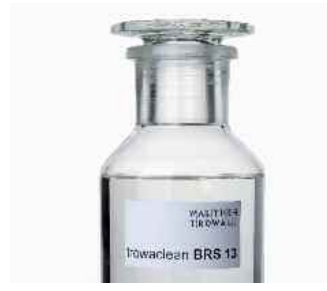
Cleaning agent BRS 13

Despite modern cleaning technology, knives, forks and spoons seldom leave dishwashing machines completely dry and stain free. Result: cutlery cannot be used without labor intensive polishing. The Trowal BT cutlery drier range provides shiny and hygienic results.