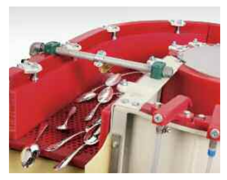
Rinsing area of a BRA machine