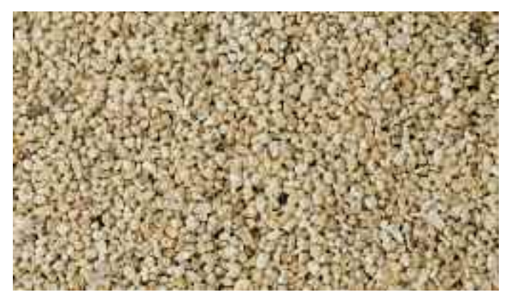
Drying granules GTM