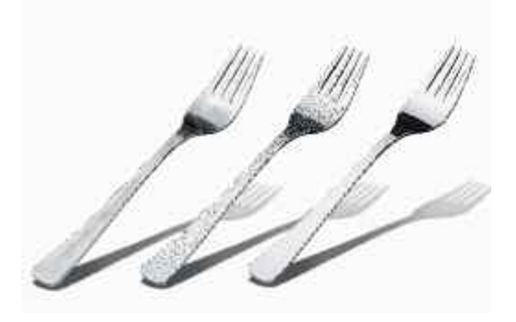
Stainless steel cutlery before and after reconditioning

Under continued use, cutlery parts become tarnished, show scratches, lime scale and corrosion stains or layers of oxide which often can be difficult to remove. The BRA is perfect for reconditioning and polishing of cutlery and kitchen utensils made of stainless steel and silver.