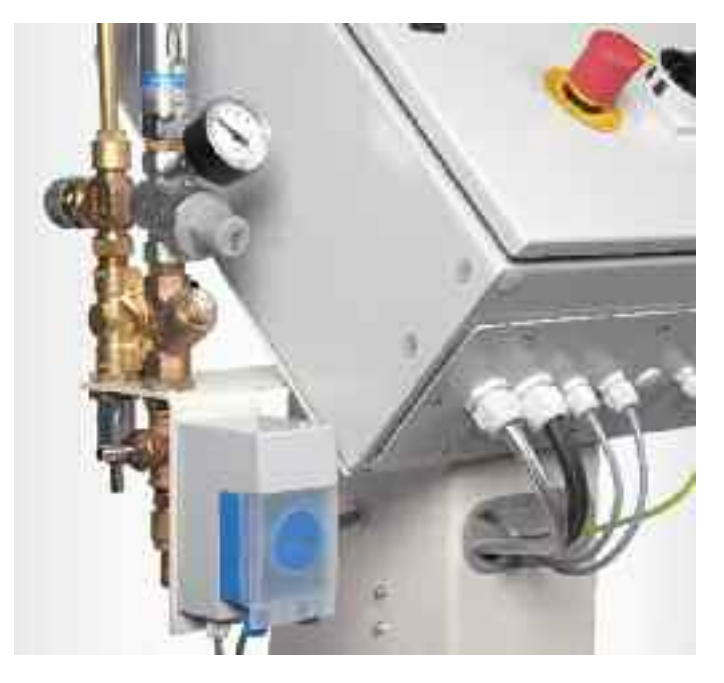
Dosing station for adjustable quantities of the cleaning agent

Stainless steel or silver cutlery parts are gently cleaned with maximum savings of energy and cleaning agent. The time consuming and labor intensive pre-cleaning of the dirty cutlery can be eliminated. The expensive manual post polishing process is no longer required.