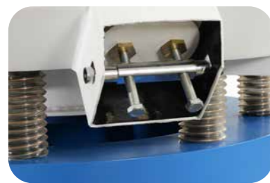
Media Unload Gate