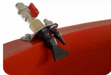
Water and Compound Inlet Valve