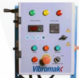
Electrical Control Panel